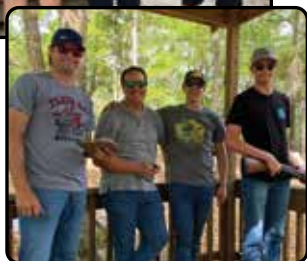
The North Central Florida Chapter held its 2 nd Annual Sporting Clay Shoot and had a great time!