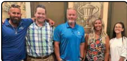
The Charlotte Harbor Chapter held a CE course on service truck safety in March.

Fore! Better Pools and Spas presents the Chapter's Annual Golf Tournament at Heron Creek Country Club on May 6. Thank you to the following sponsors for making this event take place: Better Pools & Spas, Brenntag, HornerXpress, Stenner Pump, Just Against Children Drowning, Diamond Brite, National Pool Route Sales, Hayward, Ledge Lounger, Pool Corp, Universal White Cement,